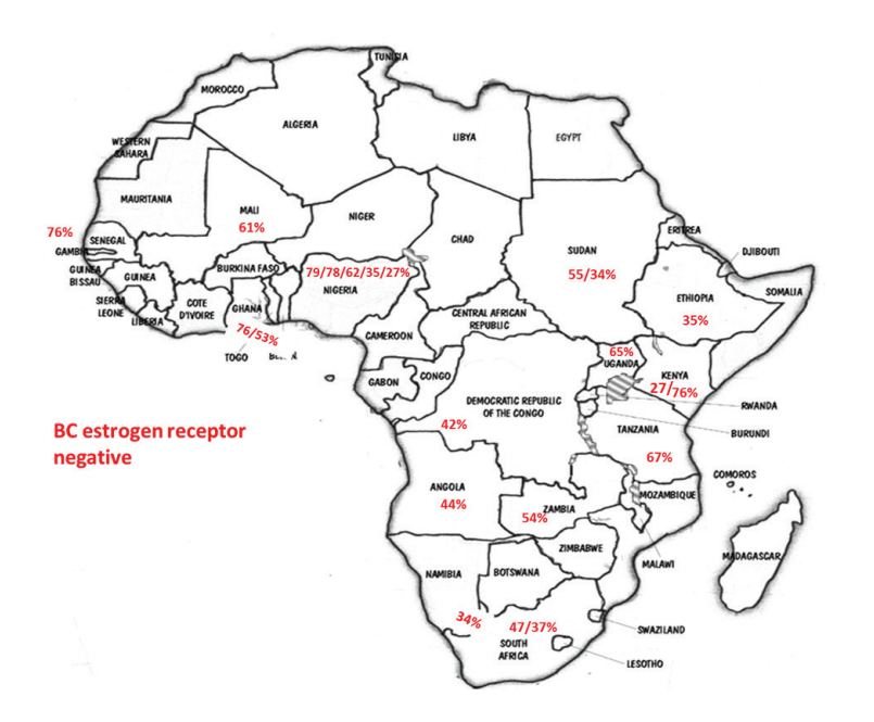
Figure 1. Percentage of negative oestrogen receptor in different SSA countries according to the data of studies referenced in this paper as well as our results (BC – breast cancer).

of the cases were ER negative in Ethiopia (an East African country) and the proportion of ER-negative tumours decreased with advancing age at diagnosis and was not affected by histology or stage [43]. Corroborating this data, a study conducted in Kenya (an East African country) by Syed S et al. presented a definitive prospective analysis of ER/PR/HER2 from a single centre and demonstrated that the prevalence of receptor status was comparable with that in the West [44]. Our results and abovementioned studies regarding ER negative were aggregated in Figure 1. In Table 2, we compare our results with the available SSA breast cancer phenotype data [32–34, 36, 38, 44–46]. We found that results from Luanda, Angola are quite similar to those described in neighbouring countries.