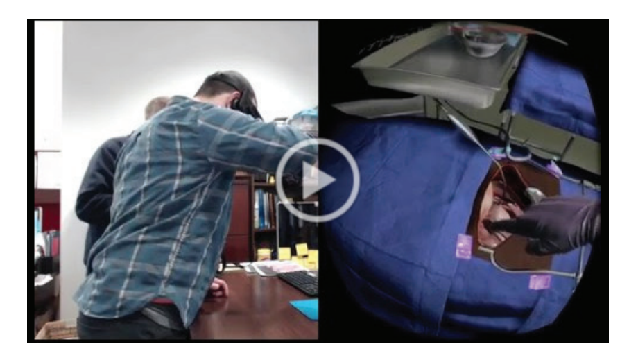
Video 1. Virtual reality surgical simulation demonstration. To view this video, click here <a href="https://ecancer.org/journal/13/910-creating-a-low-cost-virtual-reality-surgical-simulation-to-increase-surgical-oncology-capacity-and-capability.php">https://ecancer.org/journal/13/910-creating-a-low-cost-virtual-reality-surgical-simulation-to-increase-surgical-oncology-capacity-and-capability.php</a>.