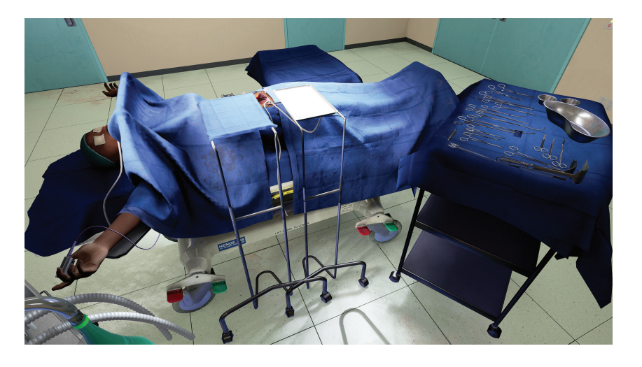
Figure 5. View of virtual operating theater from potential view of assisting surgeon or nurse.