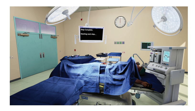
Figure 4. Wide view of virtual operating theater, shows user interface and potential for light position customization.

Figure 3. View of the virtual operating theater with callouts from real world references.