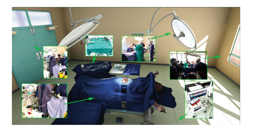
Figure 3. View of the virtual operating theater with callouts from real world references.

Figure 2. View of surgical instruments in the VR simulation.