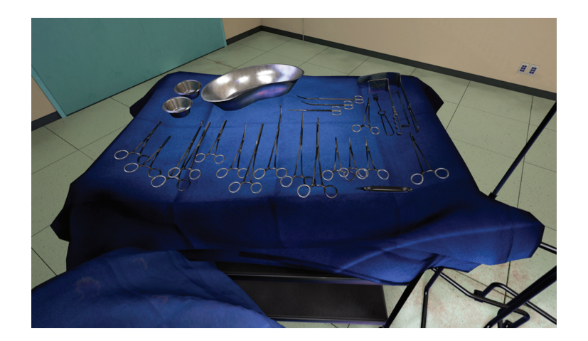
Figure 2. View of surgical instruments in the VR simulation.